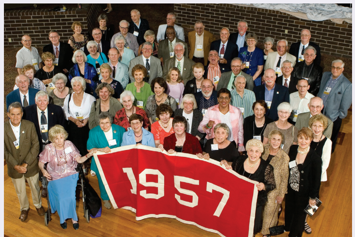
Members of the Class of 1957 on campus last May to commemorate their 50th reunion and to celebrate raising over $50,000 in support of "Honoring Our Professors Fund for the Libraries." Most of the money raised was through the Class of '57 Reunion Gift. Other classes are expected to join in support of this fund through their own reunion giving.