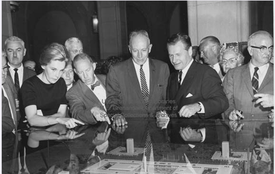
Governor Nelson Rockefeller presents the architectural model of the University of Albany's uptown campus designed by Edward Durell Stone.

University at Albany's Libraries will share a portion of a $180,000 grant from the Getty Foundation's Campus Heritage Initiative. The grant will be used to develop a long-term plan to preserve and enhance the university's uptown campus designed by Edward Durell Stone. The Libraries will be responsible for a public