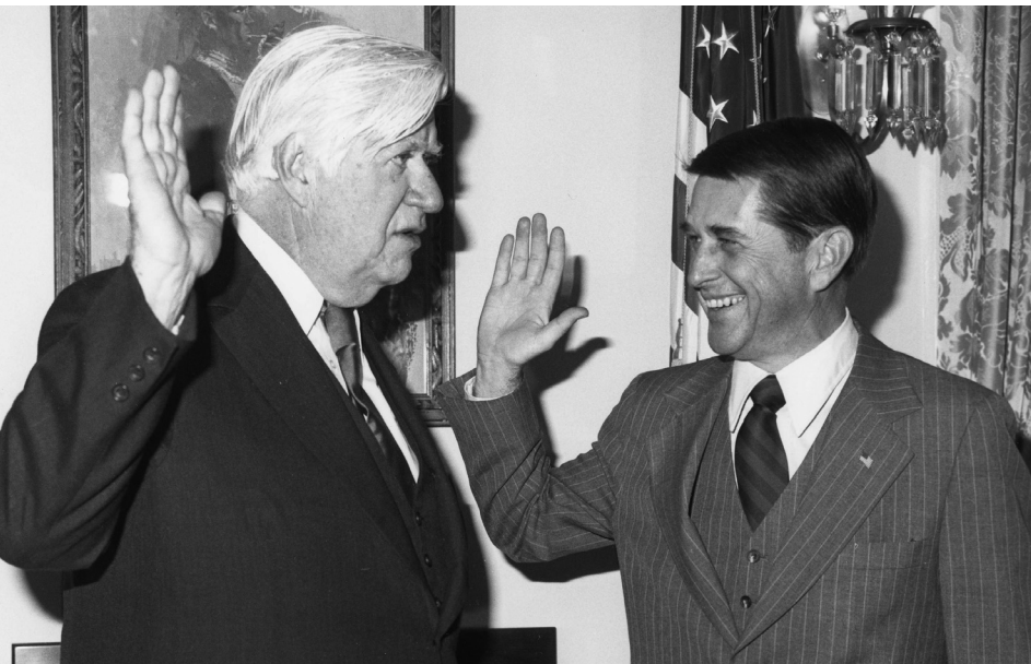
Speaker of the House Thomas "Tip" O'Neill at Congressman Gerald Solomon's swearing-in ceremony, 1980.