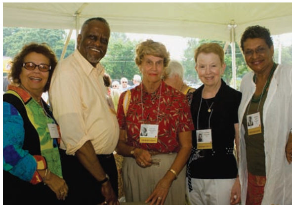
Class of '57 Reunion.

The Libraries hosted a brunch to celebrate the Class of 1957 during Reunion Weekend, June 2, in the Standish Room, Science Library.